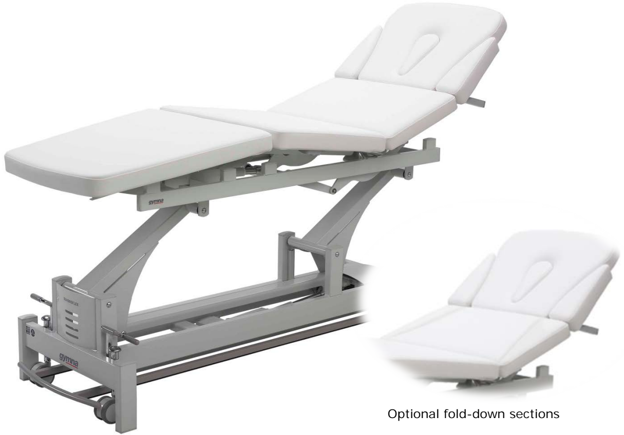
Optional fold-down sections